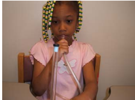
See Scape (Feedback for oral pressure)