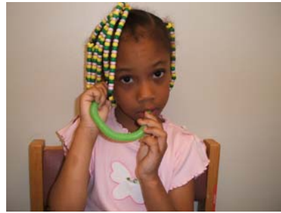
Listening Tube (Feedback for oral pressure)